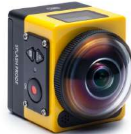
Kodak PixPro SP360 4K : 235°